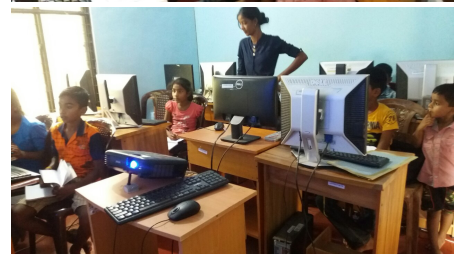
Our Kids Getting Their Hands on New Technology